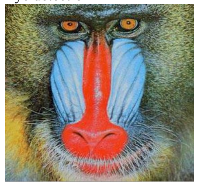
From ColorSpace plugin, extract Cr component